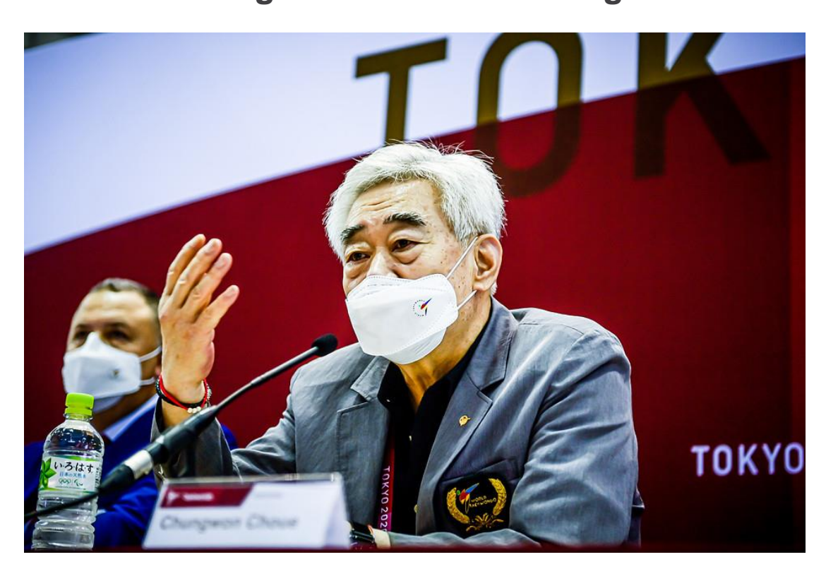
"Para Taekwondo will play an important role"